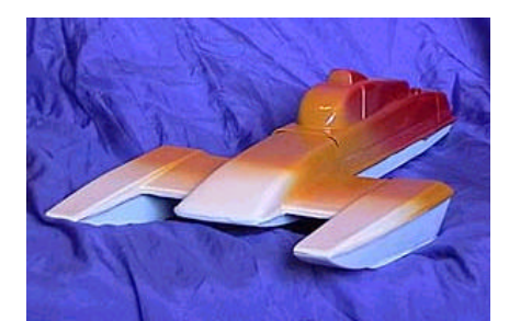
GTM Rigger built by Andrew Gilchrist of fastelectrics.com

smaller and small motors are becoming increasingly powerful and efficient. One area of particular interest is the development of Li-ion cells. These are now common in mobile phones and camcorders and it is feasible that they could power a boat fitted with a 400-size motor at racing speeds for more than half an hour!