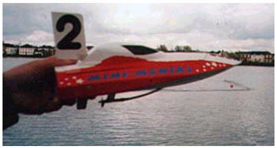
Ian Phillips ECO 400 Mono

micro sized boat and also features a useful discussion forum.