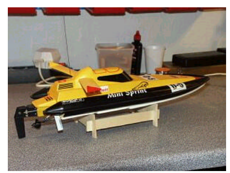
Graupner Mini Sprint Built by Kasper Arvad

Graupner, Robbe and Danvo have realised the potential market for smaller models and have started producing complete boat kits in a variety of hull styles.